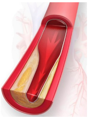
Cholesterol can join with fats and other substances in your blood to build up in the inner walls of your arteries. The arteries can become clogged and narrow, and blood flow is reduced.

It's important to know your cholesterol numbers; work with your health care professional to treat your overall risk of heart attack and stroke.