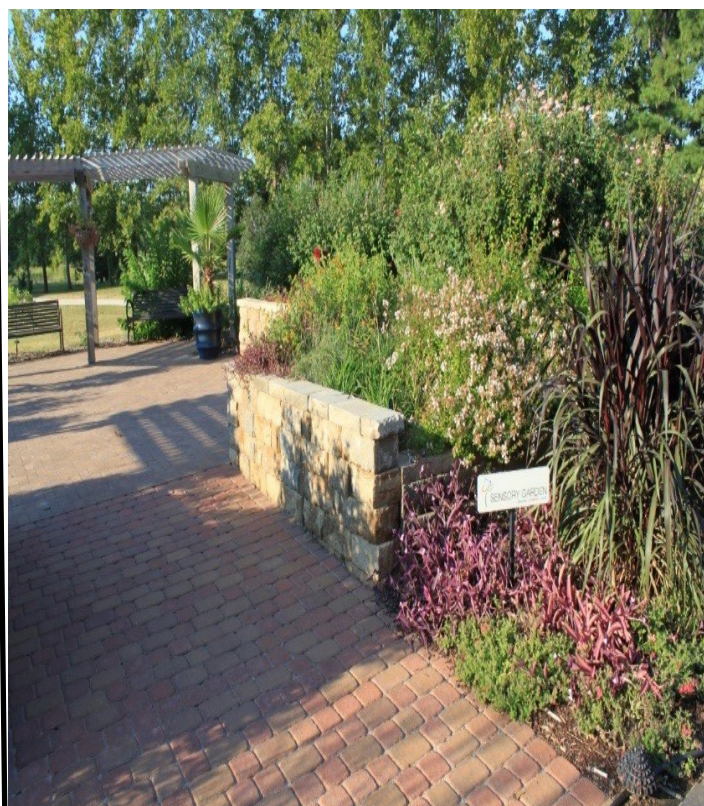
Figure 1: Sensory garden at The Botanic Garden at Oklahoma State University

Sensory gardens are designed specifically to center around the visitors' five senses as they explore plants (Figure 1). A sensory themed garden might have herbs that can be smelled or eaten, plants of various textures (such as lambs' ears or African violets) that can be touched and many different colors and sizes of flowers for a visually appealing space. A sensory garden could also have a noise element like flowing water or wind chimes. This type of sensory garden space is meant to encourage both active and passive engagement within the garden and create a sense of calmness within its visitors.